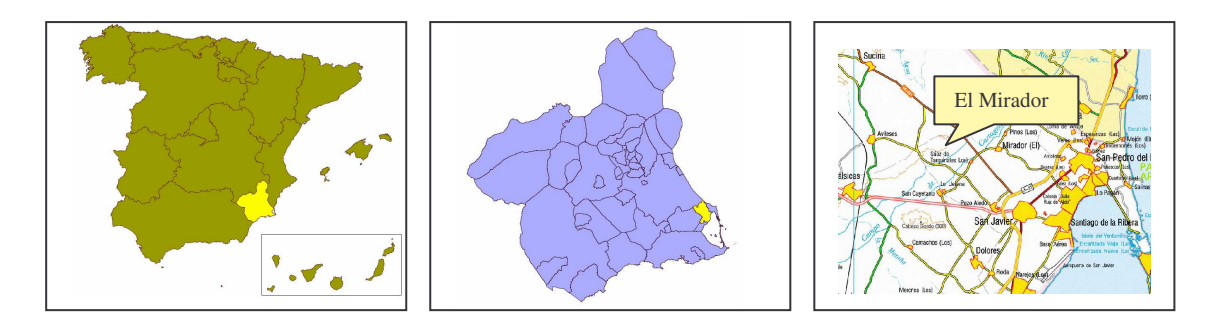
Figure 2: Geographical location

Site Description and Field Experimental Design: the study area is located in the Centro de Transferencia Tecnológica El Mirador, (San Javier), South east of the Autonomous Community of the Region of Murcia, (Fig 2). The study area is divided in two halves. Plot A treated with a chemical fertilization and plot B with organic amendment using crop residues –pepper- dry and crushed.