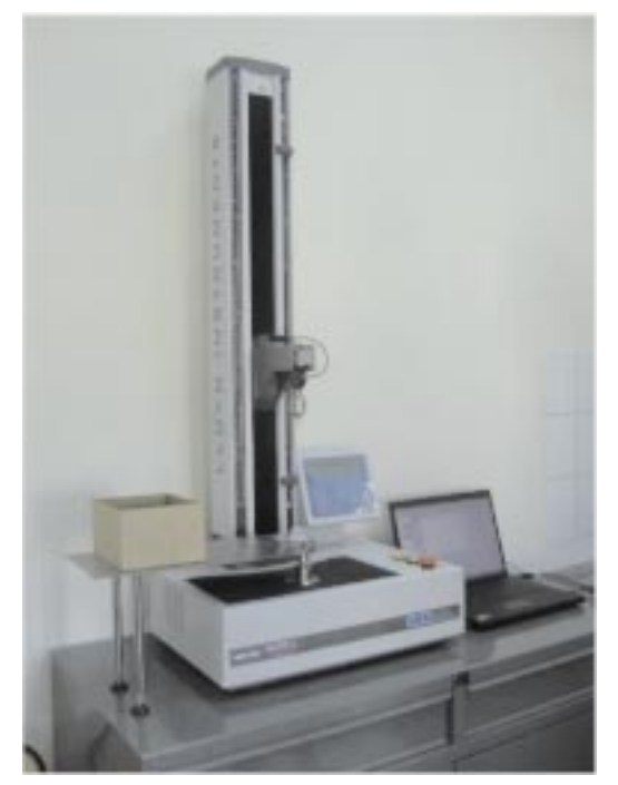
Figure 1. Friction test device