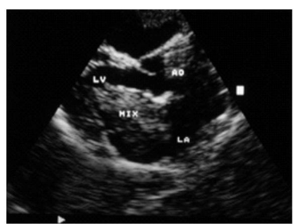
Figure 1. Two dimensional echocardiogram of myxoma: Note tumor plop to left ventricle during diastole and concomitant mitral insufficiency.

regurgitation. (Figure 1). She had no other disorder. Her family members had no history of intracardiac tumors.